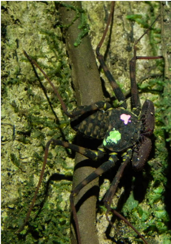
Fig. 1. Phrynus pseudoparvulus individuals with markings on its cephalothorax.

We conducted manipulations on a total of 28 individuals ( n=28 ). Half of the individuals ( n=14 : 8 females and 6 males) were deprived of olfactory perception (olfaction-deprived) and half underwent a sham manipulation (olfaction-intact) ( n=14 : 8 females and 6 males). To deprive individuals of olfactory perception, the distal 1 cm of the antenniform legs (distal tarsi) of olfaction-deprived individuals was clipped with scissors to remove the entirety of their olfactory sensilla. This procedure has been used in similar studies on other arthropods, such as crustaceans (Corotto et al., 1999; Kamio et al., 2005; Maruzzo et al., 2007) and insects (Roth and Barth, 2009; Vacha et al., 2008). Olfactory sensilla, and the capacity for olfaction, are restricted to this distal portion of the antenniform legs (Hebets, 2002). The distal 1 cm of the second pair of walking legs (distal tarsi) was likewise clipped as a procedural control, or sham, on individuals in the olfaction-intact treatment. When possible, we randomized the treatment for the 28 individuals making every attempt to pair sex and age groups across treatments.